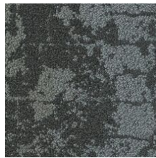
Lava 05500 LRV 7.3