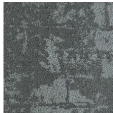
Fragile 05760 LRV 15.2