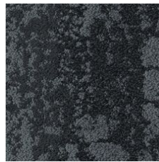
Deepest 05505 LRV 5.3