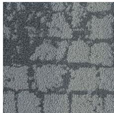
Untamed 05595 LRV 16.1