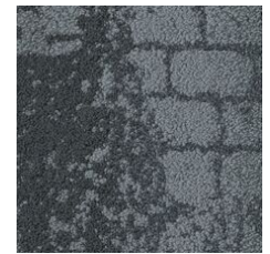
Calm 05580 LRV 11.1