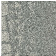
Optimistic 05105 LRV 23.3