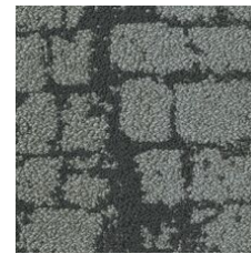
Wild 05557 LRV 12.2