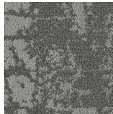
Mountain 05761 LRV 12.5